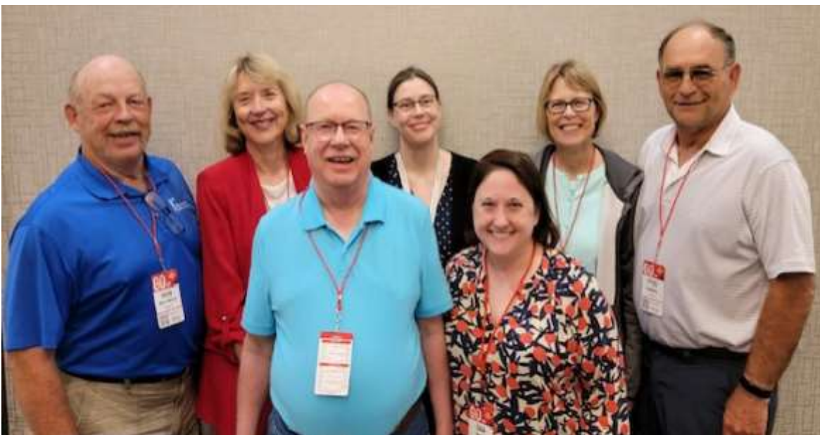
Synod Assembly members from Faith & Grace