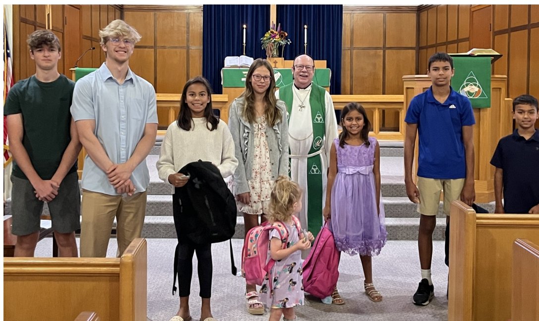
Blessings of School Back Packs Sunday August 10, 2025