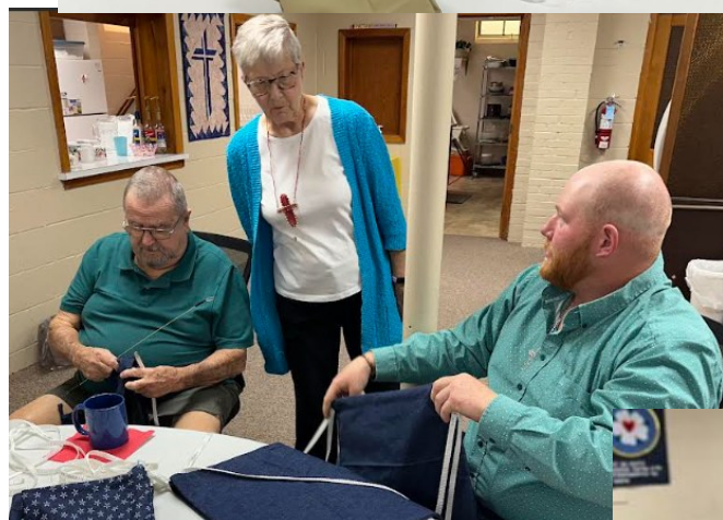
Assembling Back Packs for Lutheran World Relief!